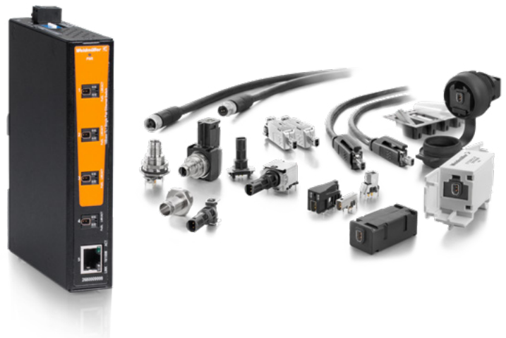
Broad SPE portfolio of Weidmüller according to IEC 63171-2

Last, but not least, testing and certification of devices and components is necessary. Adherence to SPE standards and obtaining relevant certifications ensure interoperability and reliability. Rigorous testing validates performance under various conditions.